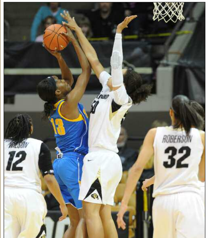
Two of Colorado's all-time best one-half defensive performances, in terms of points allowed, came in a one-week span in 2014.