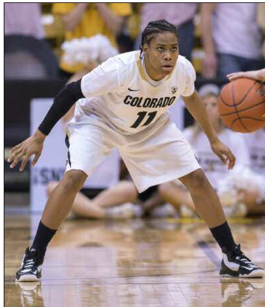
Colorado set school records for scoring defense (54.5 ppg) and FG defense (.350) in 2012-13.